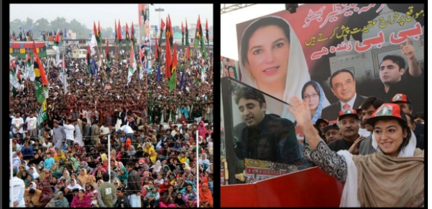
PPP Chairman Bilawal Bhutto Zardari addressing a public gathering at Garhi Khuda Baksh along with his sister, Ms. Aseefa Bhutto Zardari