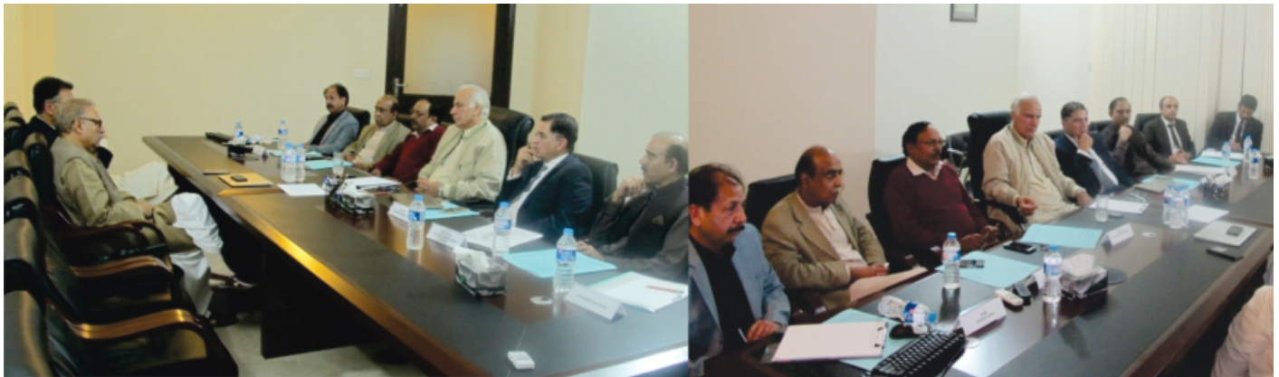
Meeting at the PTI Election Commission Office on December 9, 2015

On December 30, 2015, the PTI Election Commission released a test registration procedure, which is indicative of the fact that the party is working diligently to hold internal elections in a serious manner so as to avoid irregularities based on lessons learnt in the previous party elections 14 .