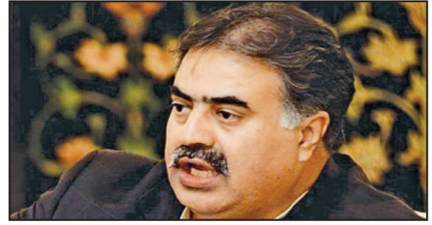
Nawab Sanaullah Khan Zehri, new Chief Minister of Balochistan

On December 10, 2015, Prime Minister Nawaz Sharif announced the nomination of Nawab Sanaullah Zehri for the post of Chief Minister Balochistan and on December 23, 2015, he was elected in the Balochistan Assembly unanimously. Although a meeting of all important stakeholders under the Murree accord took place that was presided by the Prime Minister himself before it was decided to put Nawab Sanaullah Zehri in the said position, it is not clear if any internal party meetings of the PML-N took place for the purpose of selecting the new Chief Minister of Balochistan.